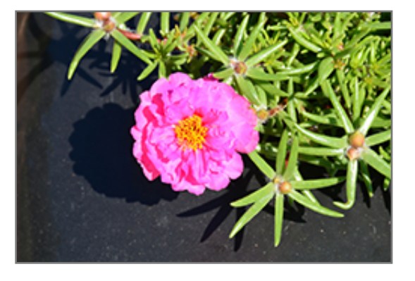
Stopwatch Fuchsia Portulaca flowers