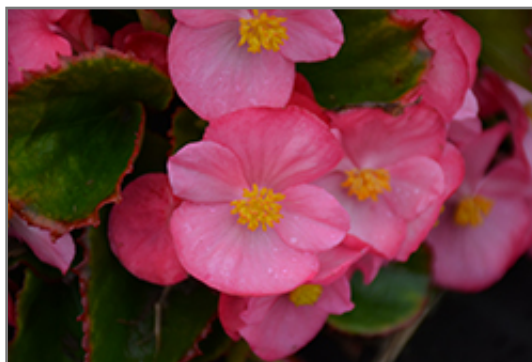
Sprint Plus Rose Begonia flowers

This is a high maintenance plant that will require regular care and upkeep, and usually looks its best without pruning, although it will tolerate pruning. Deer don't particularly care for this plant and will usually leave it alone in favor of tastier treats. Gardeners should be aware of the following characteristic(s) that may warrant special consideration;