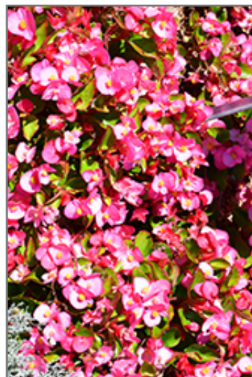
Sprint Plus Rose Begonia flowers

Sprint Plus Rose Begonia is a fine choice for the garden, but it is also a good selection for planting in outdoor containers and hanging baskets. It is often used as a 'filler' in the 'spiller-thriller-filler' container combination, providing a mass of flowers against which the thriller plants stand out. Note that when growing plants in outdoor containers and baskets, they may require more frequent waterings than they would in the yard or garden.