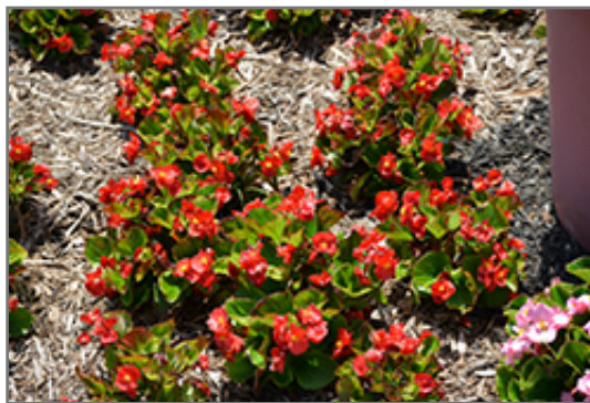
Sprint Plus Red Begonia in bloom