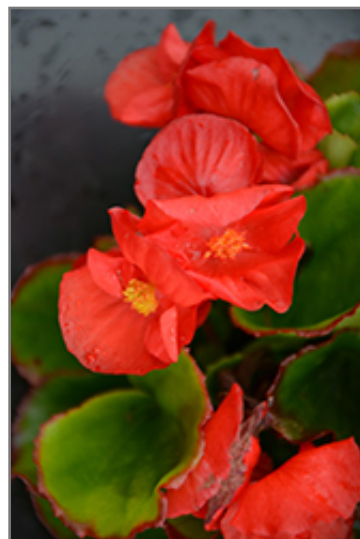
Sprint Plus Red Begonia flowers

This is a high maintenance plant that will require regular care and upkeep, and usually looks its best without pruning, although it will tolerate pruning. Deer don't particularly care for this plant and will usually leave it alone in favor of tastier treats. Gardeners should be aware of the following characteristic(s) that may warrant special consideration;