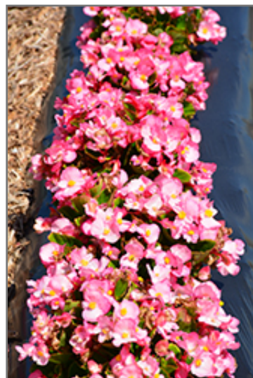
Sprint Plus Pink Begonia in bloom

Sprint Plus Pink Begonia is a fine choice for the garden, but it is also a good selection for planting in outdoor containers and hanging baskets. It is often used as a 'filler' in the 'spiller-thriller-filler' container combination, providing a mass of flowers against which the thriller plants stand out. Note that when growing plants in outdoor containers and baskets, they may require more frequent waterings than they would in the yard or garden.