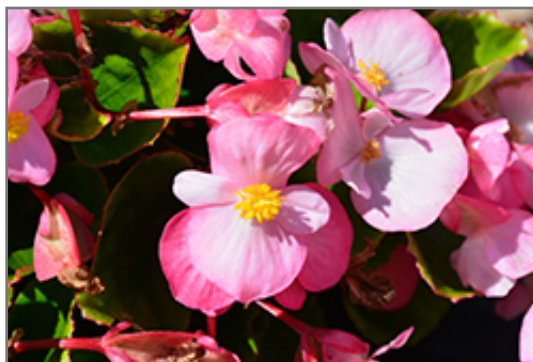
Sprint Plus Pink Begonia flowers

This is a high maintenance plant that will require regular care and upkeep, and usually looks its best without pruning, although it will tolerate pruning. Deer don't particularly care for this plant and will usually leave it alone in favor of tastier treats. Gardeners should be aware of the following characteristic(s) that may warrant special consideration;