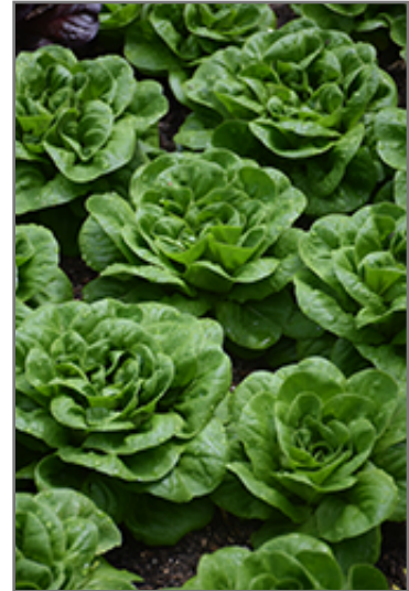
Buttercrunch Lettuce

Buttercrunch Lettuce will grow to be about 12 inches tall at maturity, with a spread of 6 inches. When planted in rows, individual plants should be spaced approximately 8 inches apart. This vegetable plant is an annual, which means that it will grow for one season in your garden and then die after producing a crop. Because of its relatively short time to maturity, it lends itself to a series of successive plantings each staggered by a week or two; this will prolong the effective harvest period.