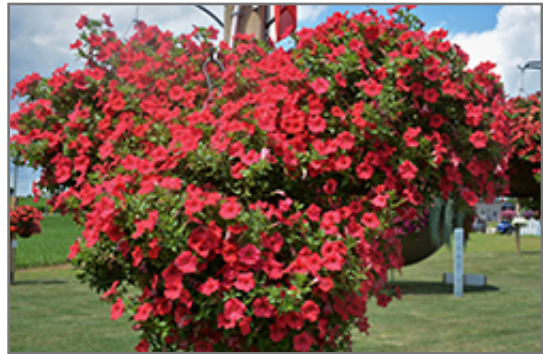
ColorRush Watermelon Red Petunia in bloom

ColorRush Watermelon Red Petunia will grow to be about 12 inches tall at maturity, with a spread of 30 inches. When grown in masses or used as a bedding plant, individual plants should be spaced approximately 24 inches apart. Its foliage tends to remain dense right to the ground, not requiring facer plants in front. This fast-growing annual will normally live for one full growing season, needing replacement the following year.