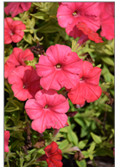
ColorRush Watermelon Red Petunia flowers