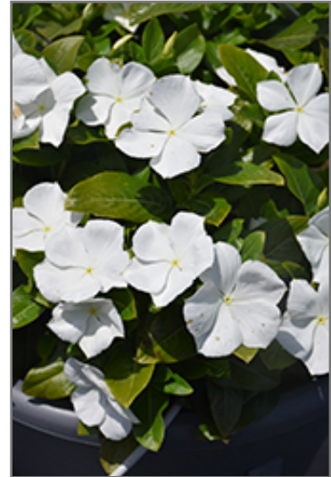
Cora XDR White flowers

Cora XDR White is recommended for the following landscape applications;