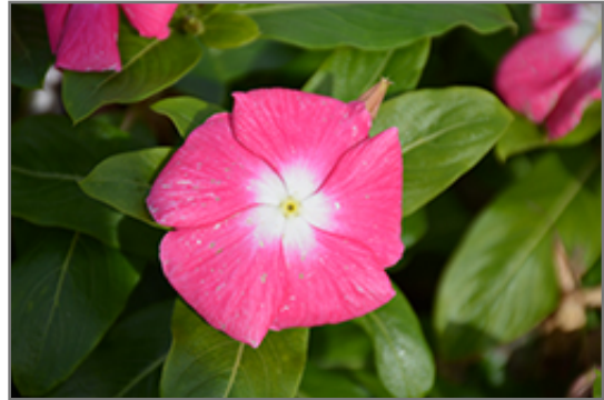
Cora XDR Pink Halo flowers

Cora XDR Pink Halo is recommended for the following landscape applications;