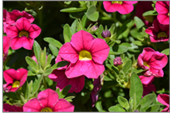
Calitastic Fancy Fuchsia Calibrachoa flowers

Calitastic Fancy Fuchsia Calibrachoa is recommended for the following landscape applications;