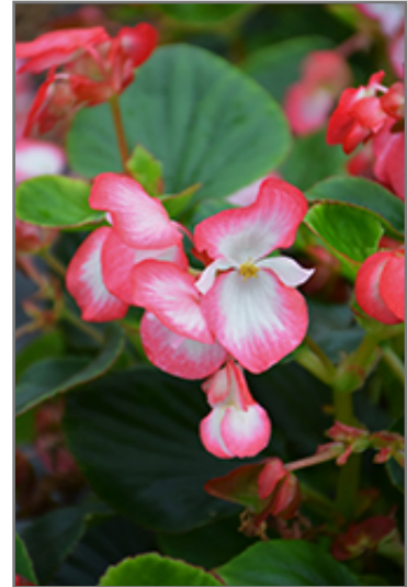
Volumia Rose Bicolor Begonia flowers

This is a high maintenance plant that will require regular care and upkeep, and usually looks its best without pruning, although it will tolerate pruning. Deer don't particularly care for this plant and will usually leave it alone in favor of tastier treats. Gardeners should be aware of the following characteristic(s) that may warrant special consideration;