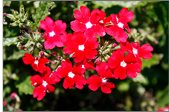
Cadet Upright Red Verbena flowers

Cadet Upright Red Verbena is recommended for the following landscape applications;