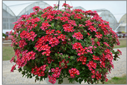
Cadet Upright Red Verbena in bloom

Cadet Upright Red Verbena will grow to be about 10 inches tall at maturity, with a spread of 14 inches. When grown in masses or used as a bedding plant, individual plants should be spaced approximately 10 inches apart. Its foliage tends to remain low and dense right to the ground. This fast-growing annual will normally live for one full growing season, needing replacement the following year.