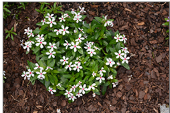
Soiree Kawaii White Peppermint Vinca in bloom