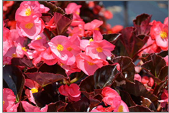
Viking Pink on Chocolate Begonia flowers

Viking Pink on Chocolate Begonia is recommended for the following landscape applications;