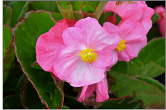
Tophat Pink Begonia flowers

Tophat Pink Begonia is recommended for the following landscape applications;