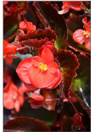
Senator IQ Scarlet flowers