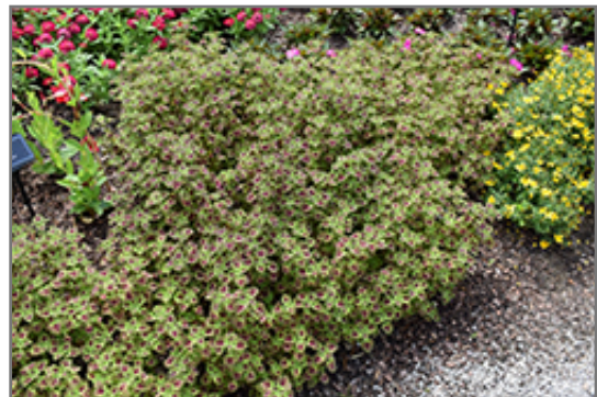
ColorBlaze Chocolate Drop Coleus