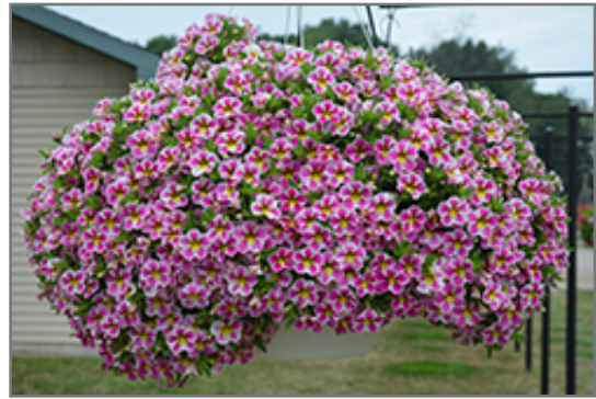
Superbells Holy Cow! Calibrachoa in bloom