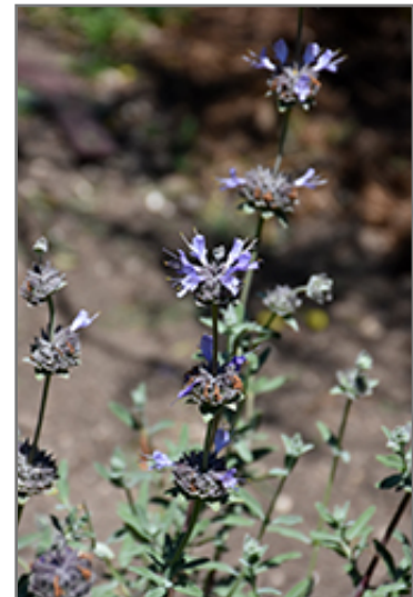
Allen Chickering Sage flowers

Moana Lane Garden Center & Corporate Office 1100 W. Moana Lane Reno, NV 89509 (775) 825-0600 (775) 825-0602 - Corporate Office