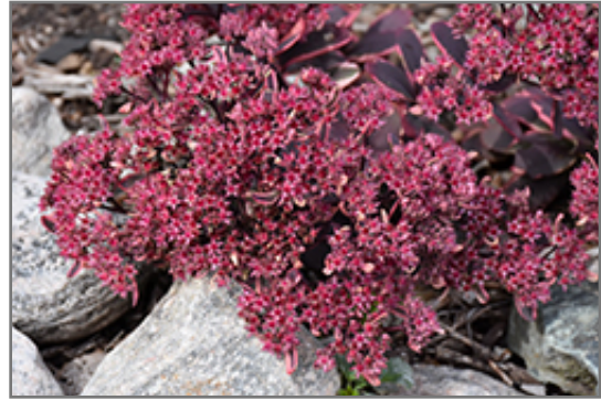
Dream Dazzler Stonecrop flowers

Dream Dazzler Stonecrop is a fine choice for the garden, but it is also a good selection for planting in outdoor pots and containers. It is often used as a 'filler' in the 'spiller-thriller-filler' container combination, providing a mass of flowers and foliage against which the larger thriller plants stand out. Note that when growing plants in outdoor containers and baskets, they may require more frequent waterings than they would in the yard or garden.