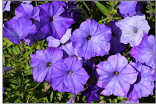
Easy Wave Lavender Sky Blue Petunia flowers

This plant will require occasional maintenance and upkeep. Trim off the flower heads after they fade and die to encourage more blooms late into the season. It is a good choice for attracting bees and hummingbirds to your yard, but is not particularly attractive to deer who tend to leave it alone in favor of tastier treats. It has no significant negative characteristics.