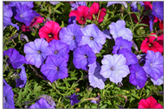
Easy Wave Lavender Sky Blue Petunia flowers