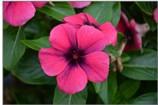
Tattoo Raspberry Vinca flowers

This plant will require occasional maintenance and upkeep, and should not require much pruning, except when necessary, such as to remove dieback. It is a good choice for attracting butterflies to your yard, but is not particularly attractive to deer who tend to leave it alone in favor of tastier treats. It has no significant negative characteristics.