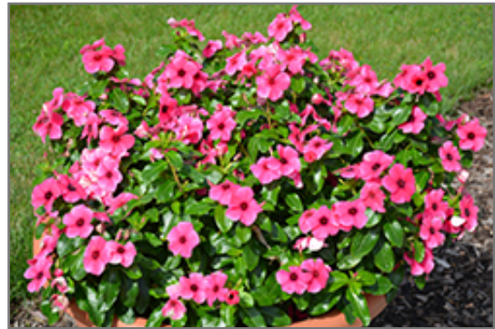
Tattoo Raspberry Vinca in bloom