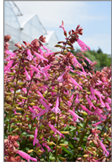
Skyscraper Pink Salvia flowers

Skyscraper Pink Salvia is an herbaceous annual with an upright spreading habit of growth. Its relatively fine texture sets it apart from other garden plants with less refined foliage.