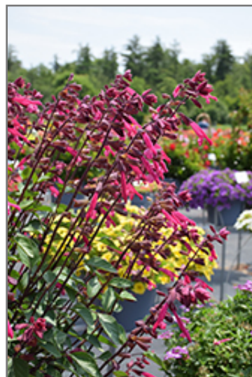
Skyscraper Dark Purple Salvia flowers

Skyscraper Dark Purple Salvia is an herbaceous annual with an upright spreading habit of growth. Its relatively fine texture sets it apart from other garden plants with less refined foliage.