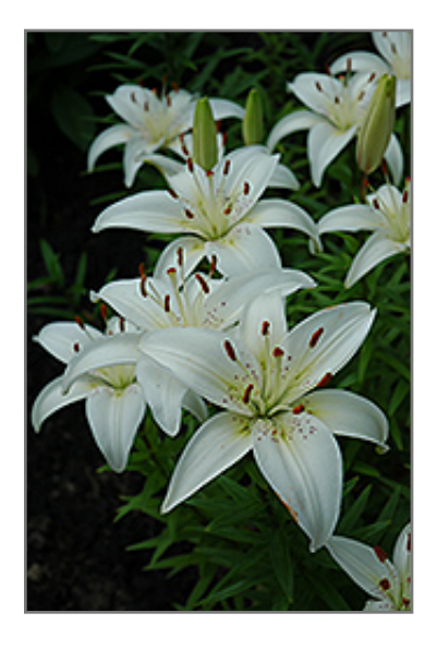
Antarctica Lily flowers

Antarctica Lily features bold white trumpet-shaped flowers with light green throats at the ends of the stems in early summer. The flowers are excellent for cutting. Its narrow leaves remain green in color throughout the season.