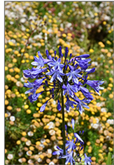
Blue Leap Agapanthus flowers

Blue Leap Agapanthus is recommended for the following landscape applications;