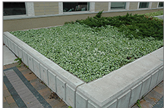
White Nancy Spotted Dead Nettle in bloom