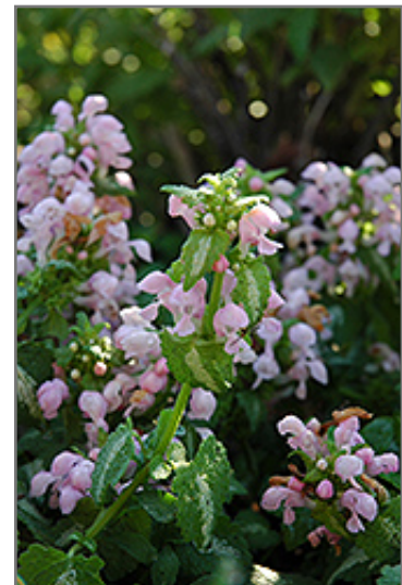
Shell Pink Spotted Dead Nettle flowers