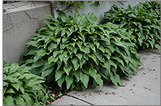
Invincible Hosta

Invincible Hosta is recommended for the following landscape applications;