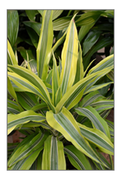
Goldstar Dracaena foliage

Moana Lane Garden Center & Corporate Office South Virginia St. Garden Center 1100 W. Moana Lane Reno, NV 89509 (775) 825-0600 (775) 825-0602 - Corporate Office