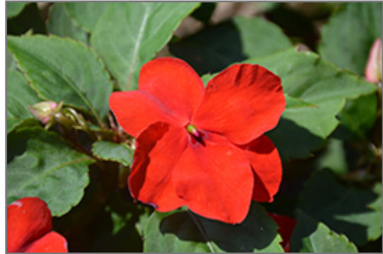
Accent Premium Red Impatiens flowers

Accent Premium Red Impatiens is recommended for the following landscape applications;