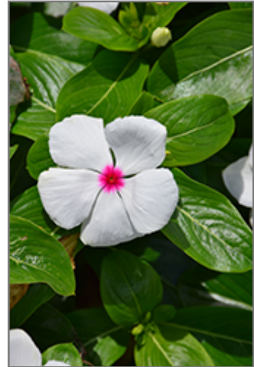
Mega Bloom Polka Dot Vinca flowers

Mega Bloom Polka Dot Vinca is recommended for the following landscape applications;