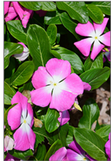
Mega Bloom Pink Halo Vinca flowers

This plant will require occasional maintenance and upkeep, and should not require much pruning, except when necessary, such as to remove dieback. It is a good choice for attracting butterflies to your yard, but is not particularly attractive to deer who tend to leave it alone in favor of tastier treats. It has no significant negative characteristics.