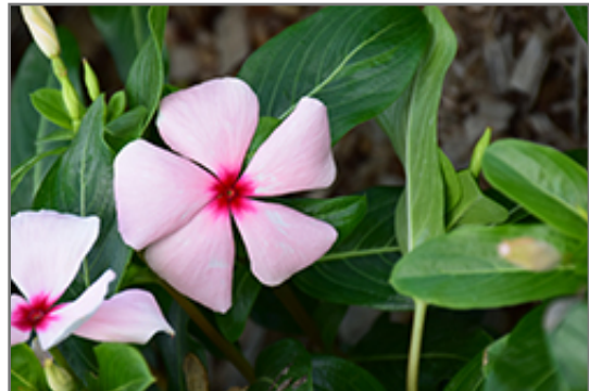
Mega Bloom Apricot Vinca flowers

Mega Bloom Apricot Vinca is recommended for the following landscape applications;