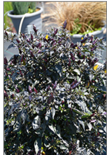
Midnight Fire Ornamental Pepper fruit