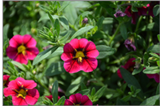
StarShine Cherry Calibrachoa flowers

StarShine Cherry Calibrachoa is recommended for the following landscape applications;