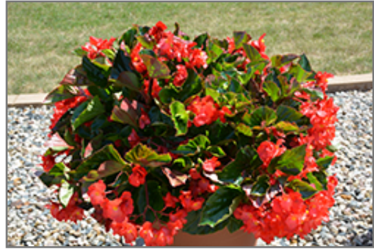
Megawatt Red Green Leaf Begonia in bloom