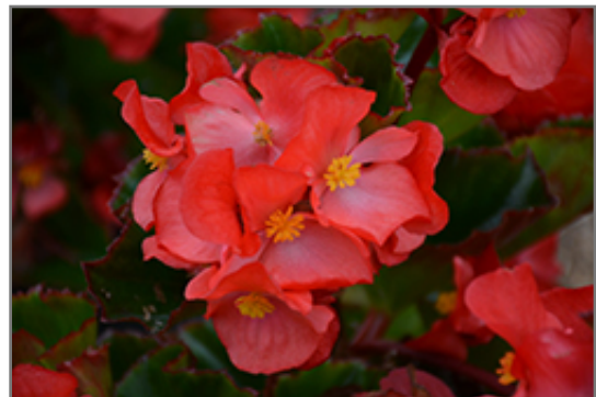
Megawatt Red Green Leaf Begonia flowers