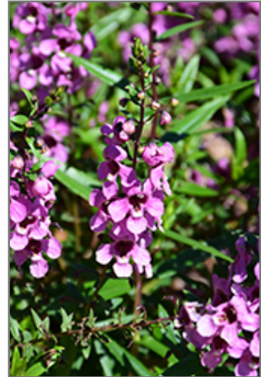
Sungelonia Pink Angelonia flowers

Sungelonia Pink Angelonia is recommended for the following landscape applications;