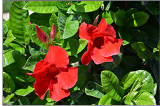
Sun Parasol Pretty Crimson Mandevilla flowers

This plant is native to the tropics and prefers growing in moist environments with evenly warm conditions all year round. In our climate, it is usually grown as an outdoor annual in the garden or in a container. If you want it to survive the winter, it can be brought in to the house and provided with special care, and then returned to the garden the following season. In its preferred tropical habitat, it can grow to be around 7 feet tall at maturity, with a spread of 24 inches. However, when grown as an annual or when overwintered indoors, it can be expected to perform differently, and its exact height and spread will depend on many factors; you may wish to consult with our experts as to how it might perform in your specific application and growing conditions.