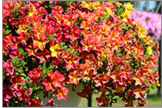
Aloha Nani Red Cartwheel Calibrachoa flowers

Aloha Nani Red Cartwheel Calibrachoa is recommended for the following landscape applications;