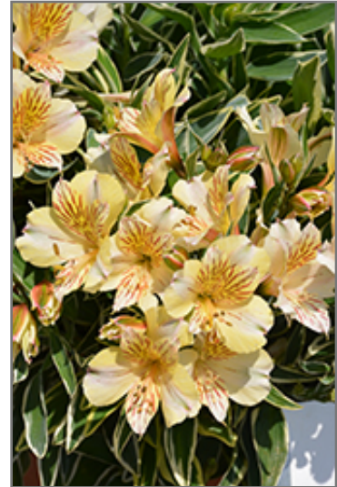
Colorita Fabiana Alstroemeria flowers

Colorita Fabiana Alstroemeria is recommended for the following landscape applications;