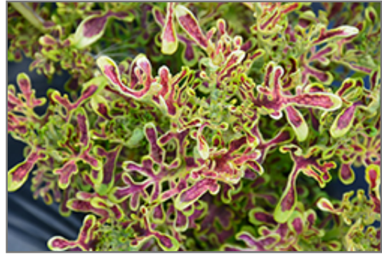
Under The Sea Red Coral Coleus foliage

Under The Sea Red Coral Coleus is recommended for the following landscape applications;