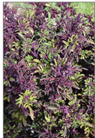
Under The Sea Lime Shrimp Coleus foliage