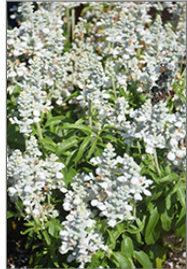
Mannequin Snow Mountain Salvia flowers

Mannequin Snow Mountain Salvia is recommended for the following landscape applications;