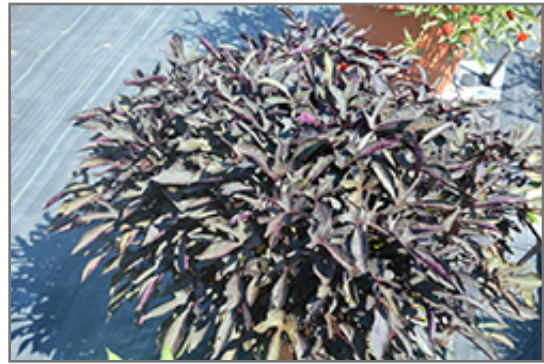
South of the Border Black Beans Sweet Potato Vine

South of the Border Black Beans Sweet Potato Vine will grow to be about 8 inches tall at maturity, with a spread of 3 feet. When grown in masses or used as a bedding plant, individual plants should be spaced approximately 12 inches apart. Its foliage tends to remain low and dense right to the ground. This fast-growing annual will normally live for one full growing season, needing replacement the following year.