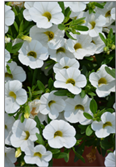
Catwalk Pure Cotton Calibrachoa flowers

This plant will require occasional maintenance and upkeep. Trim off the flower heads after they fade and die to encourage more blooms late into the season. It is a good choice for attracting bees and hummingbirds to your yard, but is not particularly attractive to deer who tend to leave it alone in favor of tastier treats. It has no significant negative characteristics.