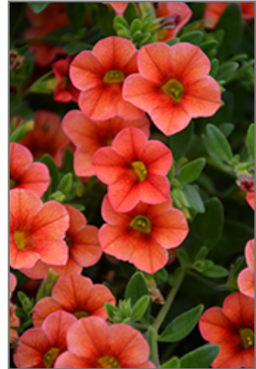
Catwalk Mandarin Glow Calibrachoa flowers

Catwalk Mandarin Glow Calibrachoa is a dense herbaceous annual with a trailing habit of growth, eventually spilling over the edges of hanging baskets and containers. Its medium texture blends into the garden, but can always be balanced by a couple of finer or coarser plants for an effective composition.