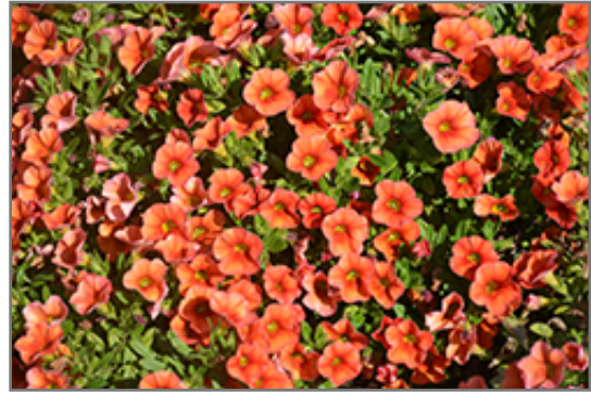
Catwalk Mandarin Glow Calibrachoa flowers