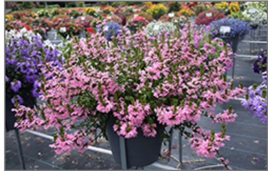
Whirlwind Pink Fan Flower in bloom

Whirlwind Pink Fan Flower is a fine choice for the garden, but it is also a good selection for planting in outdoor containers and hanging baskets. Because of its trailing habit of growth, it is ideally suited for use as a 'spiller' in the 'spiller-thriller-filler' container combination; plant it near the edges where it can spill gracefully over the pot. Note that when growing plants in outdoor containers and baskets, they may require more frequent waterings than they would in the yard or garden.