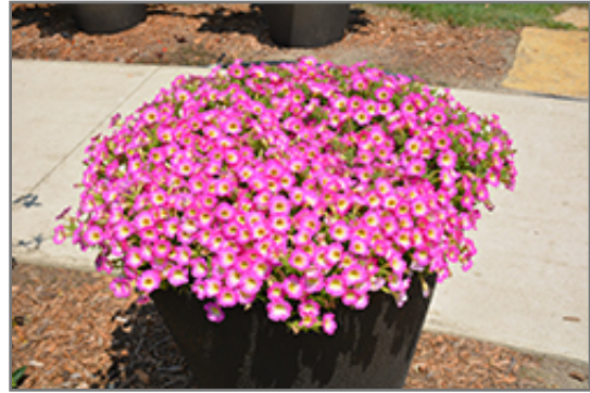
Supertunia Daybreak Charm Petunia in bloom

Supertunia Daybreak Charm Petunia is a fine choice for the garden, but it is also a good selection for planting in outdoor containers and hanging baskets. Because of its trailing habit of growth, it is ideally suited for use as a 'spiller' in the 'spiller-thriller-filler' container combination; plant it near the edges where it can spill gracefully over the pot. Note that when growing plants in outdoor containers and baskets, they may require more frequent waterings than they would in the yard or garden.