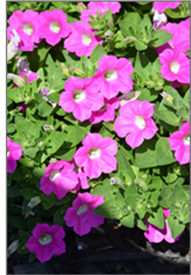
Blanket Rose Petunia flowers

Blanket Rose Petunia is recommended for the following landscape applications;