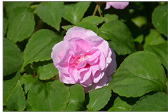
Rockapulco Orchid Impatiens flowers

Rockapulco Orchid Impatiens is recommended for the following landscape applications;